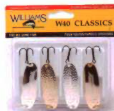
4-40 The original W40 classics