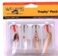
4-PCWE C50 Pearl & W30 eyed