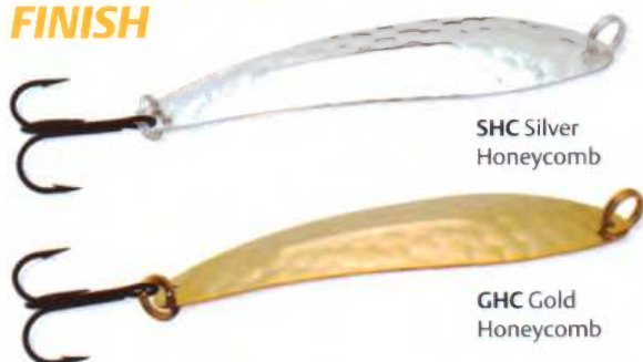
SHC Silver Honeycomb