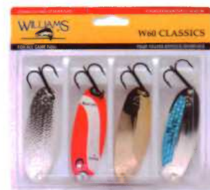
4-60 The original W60 classics