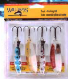
4-TTK Trout Trolling Kit

Williams 4 packs are appreciated by anglers young and old, beginners and experienced alike. They are also perfect to top off your tackle box prior to a day on the water. An ideal gift item for fathers or mothers day, a birthday or any special occasion.