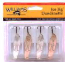
4-J50CL 1/4 oz. Ice Jig classics