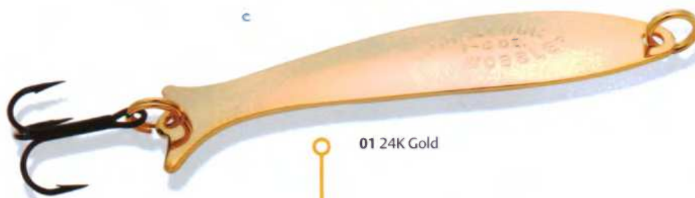
01 24K Gold