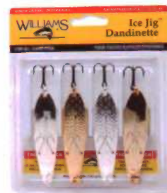
4-J60CL 1/2 oz. Ice Jig classics

Outdoor journalist Lonnie King with a BIG northern. The pike took a liking to Williams spoons at lake Kesagami in northern Ontario. The bigger the spoon the better for these big fish.