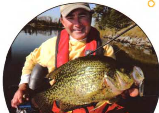
BPOR Black Pearl/ Orange

Well known Outdoor writer and personality Gord Pyzer with a nice fall Crappie caught using the Williams W30 Wabler. The W30 has just the right wobble and flash, crappie and perch can't leave it alone. From the smallest to the largest sport fish, there is a Williams lure they won't be able to resist.