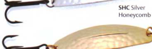
GHC Gold Honeycomb