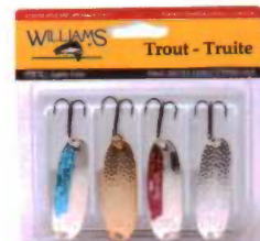
4-TK Proven Wabler patterns for trout.