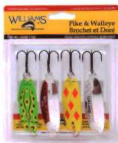
4-PW Pike and walleye favorites.