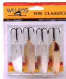
4-50 The original W50 classics