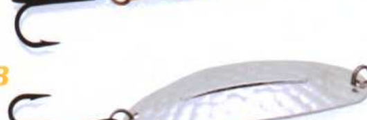
SHC Silver Honeycomb