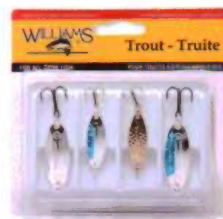
4-W32M W20 & W30 small classics